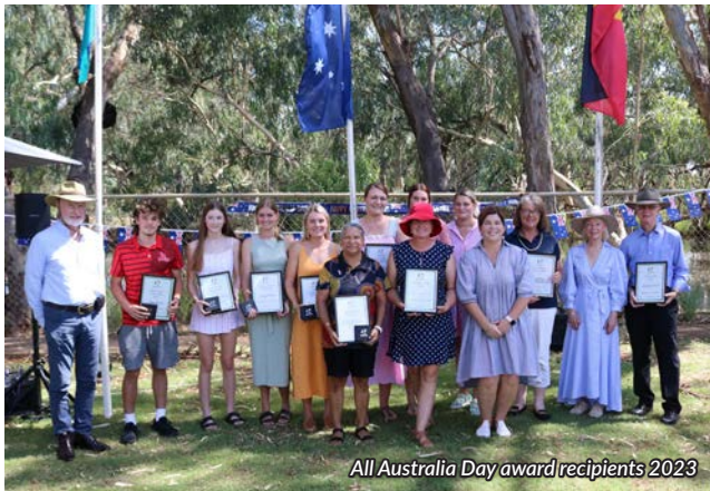
All Australia Day award recipients 2023