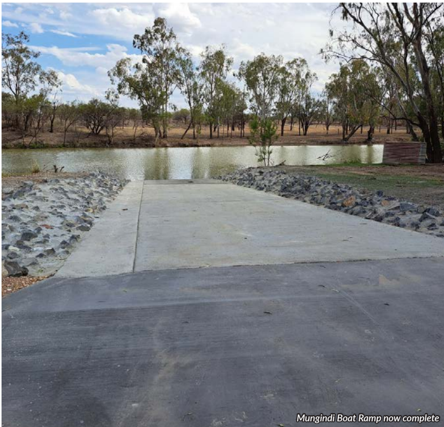
Mungindi Boat Ramp now complete

This project was managed by the Balonne Shire Council and funded by a grant from the New South Wales Government.