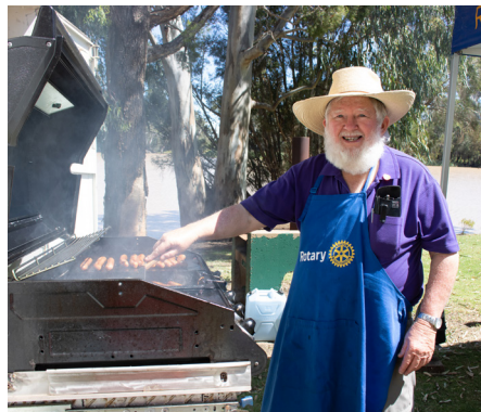
Rotary Club of St George served up a sausage sizzle to enthusiastic patrons.