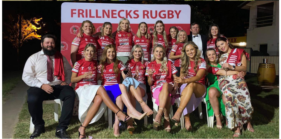
LOOKING SMART: St George Frillnecks men's and women's side officially receive their team jerseys at the club's gala evening.