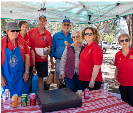
St George Lions Club.