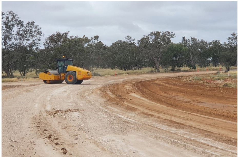
PROGRESS: Council is building roads in compliance with legislated standards.

Q. Gravel trucks are hauling on my road and causing damage; will this be