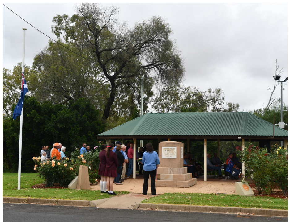
Remembrance Day brought community representatives from throughout the district to the war memorial in St George.