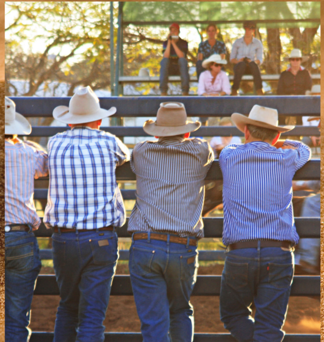
Dirranbandi Campdraft 26 -28 Aug 2022