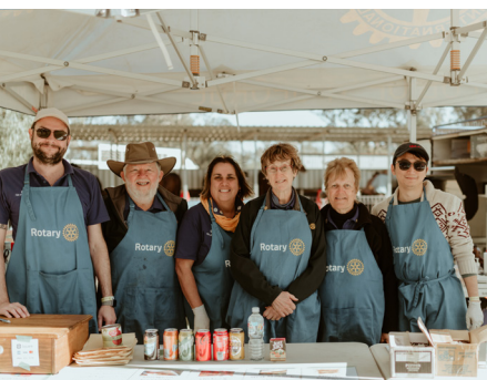
Above: St George Rotary members keeping busy on race day