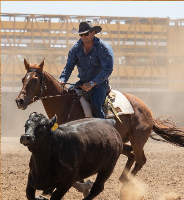
Hebel Campdraft 13-14 August 2022