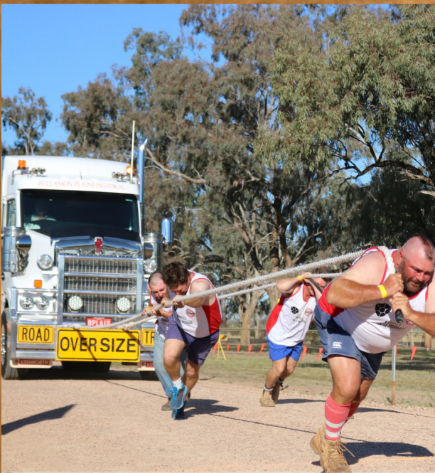
Thallon Truck Pull 27 August 2022