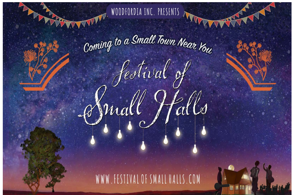
Above: Festival of Small Halls will come to Bollon on 5 October for a beautiful night of original music.