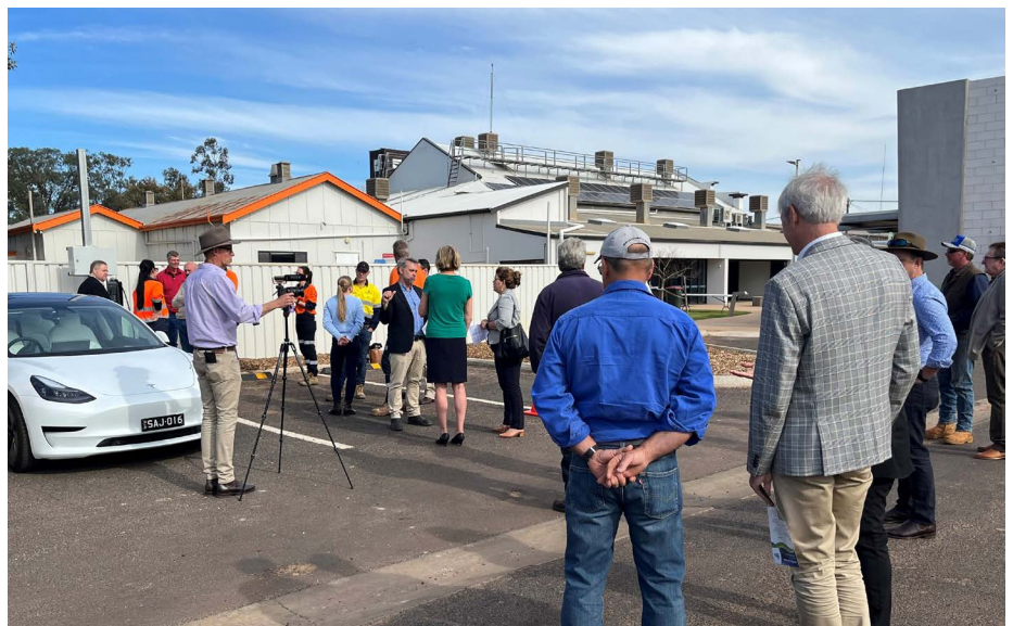
Above: Community members joined staff and industry representatives at the EV charger opening.

reliable power to improve local business, community services, and emergency resilience.