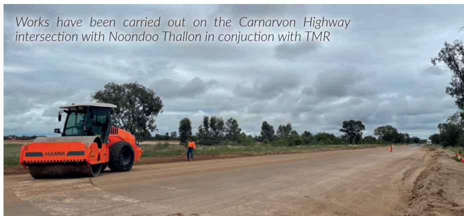
Works have been carried out on the Carnarvon Highway intersection with Noondoo Thallon in conjunction with TMR

We believe the "St George Region: You'll be Hooked" campaign will capture the imagination of Adventure Seeking tourists and help us reel them in to achieve our Marketing Goals and further create economic benefits for our region.