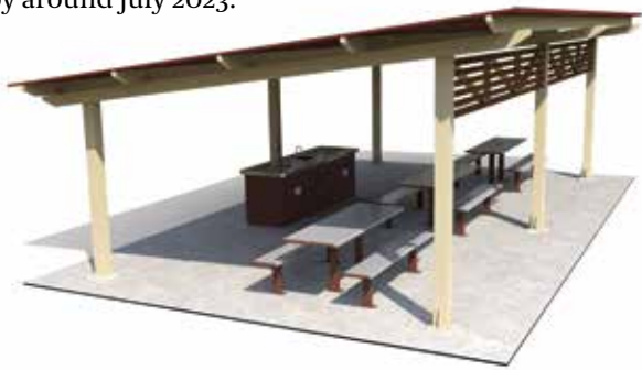
An artist's impression of the communal camp kitchen planned for Thallon campgrounds.

Works have commenced and are expected to be finalised by around July 2023.