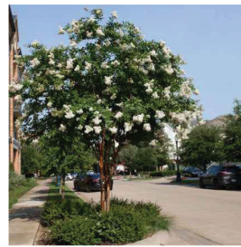
Lagerstroemia indica CREPE MYRTLE