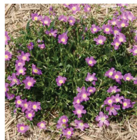
Calandrinia balonensis BROAD-LEAVED PARAKEELYA