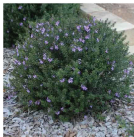
Westringia fruticosa 'Blue Gem' COAST ROSEMARY