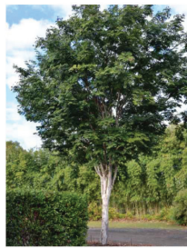
Libidibia ferax LEOPARD TREE