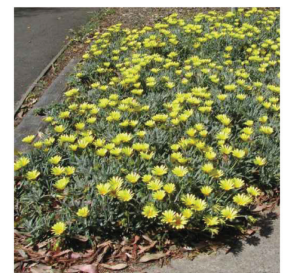
Gazania tomentosa SILVER LEAF GAZANIA