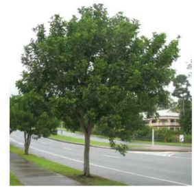
Cupaniopsis anacardioides TUCKEROO