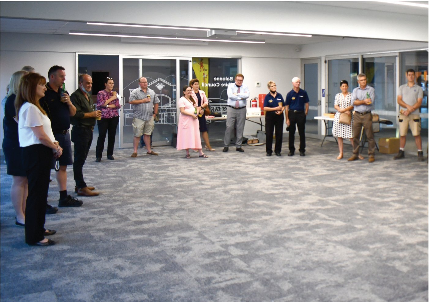
... and gathered in the Cultural Centre to convene one of their regular "Business After Hours" meetings.