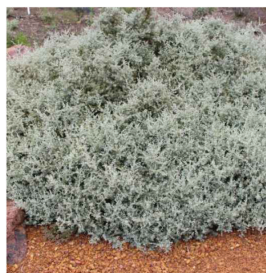
Rhagodia spinescens 'Aussie Flat Bush' SALTBUSH