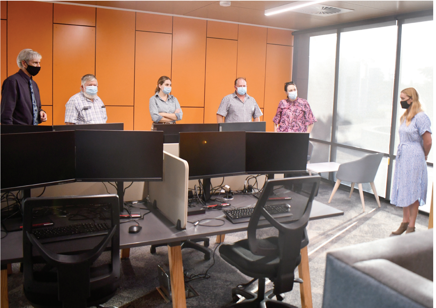
Members of the St George and District Chamber of Commerce recently inspected the new library-education-business Hub ...