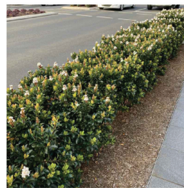
Rhaphiolepis indica 'Snow Maiden' INDIAN HAWTHORN