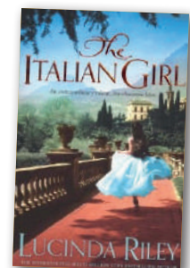
The Italian Girl by Lucinda Riley