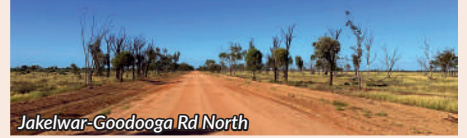
Jakelwar-Goodooga Rd North