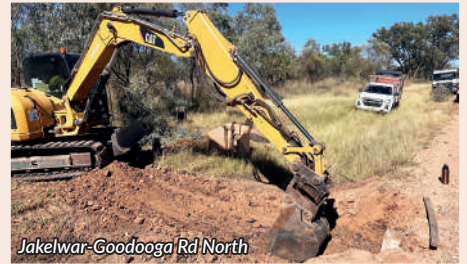
Jakelwar-Goodooga Rd North