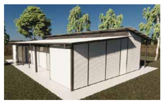
NOTE: This is an artist's render of the amenities block and may differ from the final product.

These new facilities are jointly funded by the Balonne Shire Council and the Oueensland Government's Minor Infrastructure and Inclusive Facilities Fund.