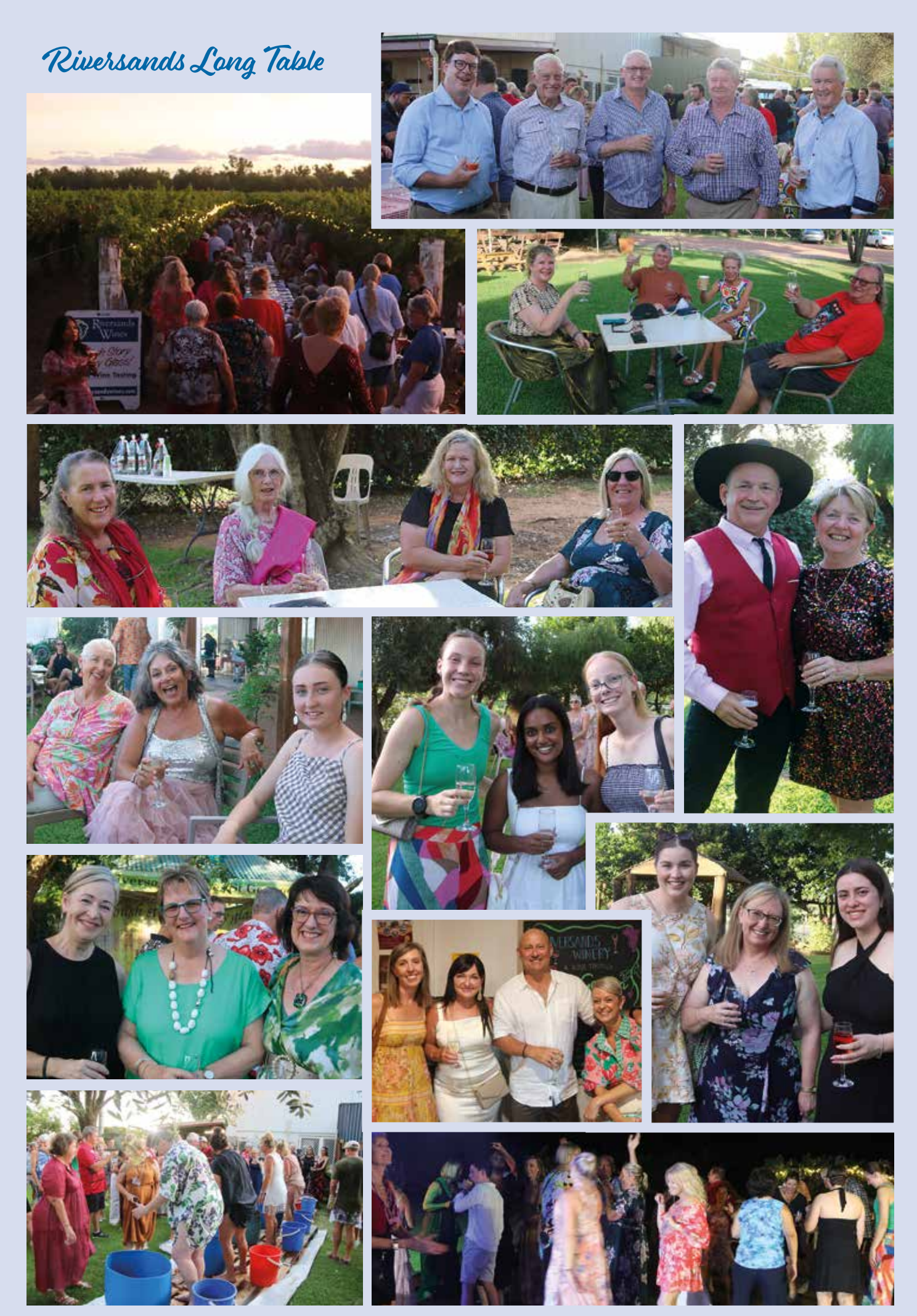
Balonne Bulletin 11