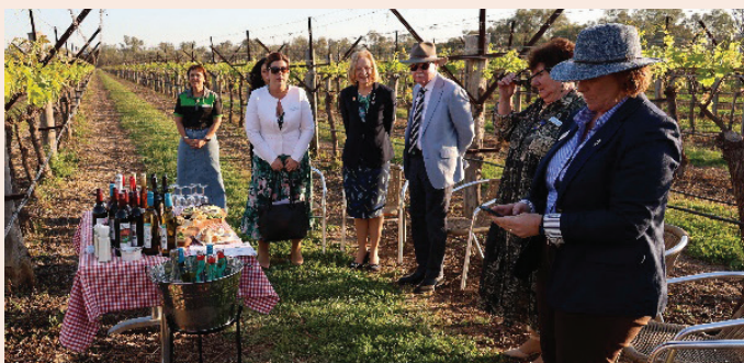
Tour of Riversands Wines