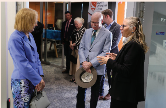
Tour of the Hub Precinct, and Country Universities Centre (CUC) St George