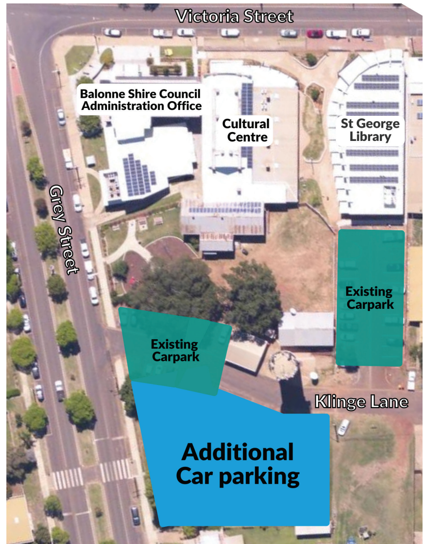
This image is indicative only and not to scale.

bringing this project to fruition as soon as possible to alleviate parking pressures in the St George CBD."