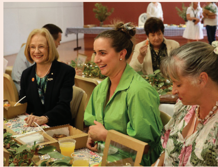
Community Luncheon at Dirranbandi