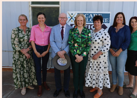
St George Meals on Wheels (Care Balonne)