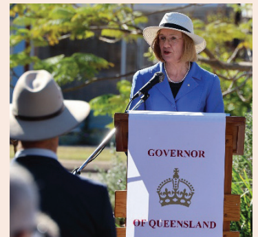
Thallon State School Q&A and Book Reading