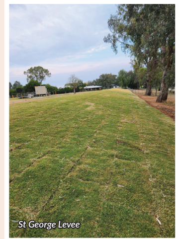
St George Levee