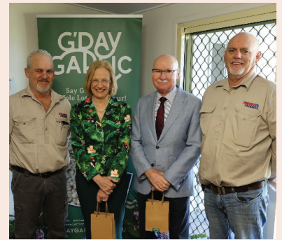
Visit Moonrocks Farm