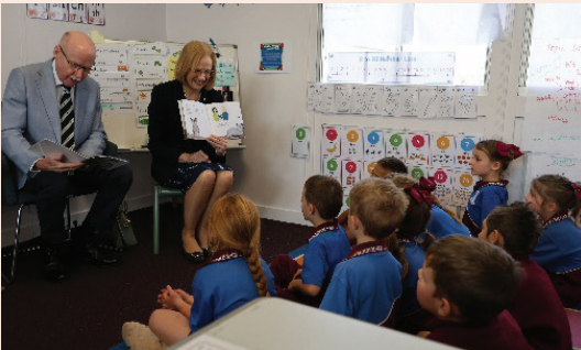
Visit to Dirranbandi State School, Thallon State School and St George State School Assemblies & Book Reading

The Governor also visited Dirranbandi, St George and Mungindi Hospitals, in line with the pledge at her swearing-in to visit all public hospitals in the State during her term, to express her gratitude to frontline healthcare workers for their hard work and dedication.