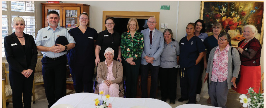
Mungindi Hospital Visit & Tour