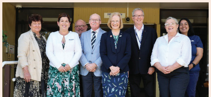
Visit QCWA Building in Dirranbandi & Dirranbandi Hospital