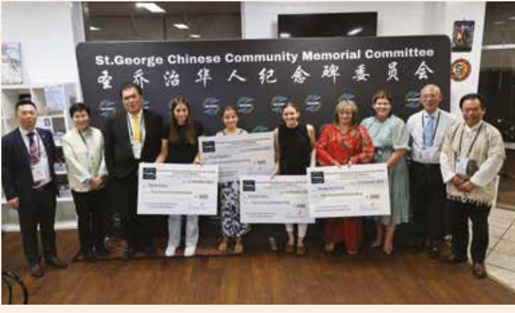
Presentation of SCCMC Bursaries