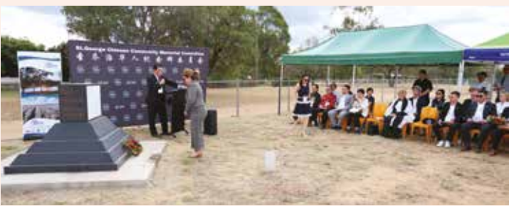
Rededication of The St George Chinese Cemetery