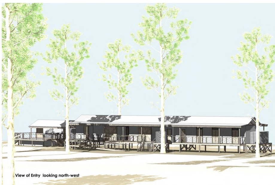
View of Entry looking north-west

When complete, the Dirranbandi Dip will become a huge drawcard for the town; in addition to hosting visitors and encouraging a longer stay in town, the facility will also have