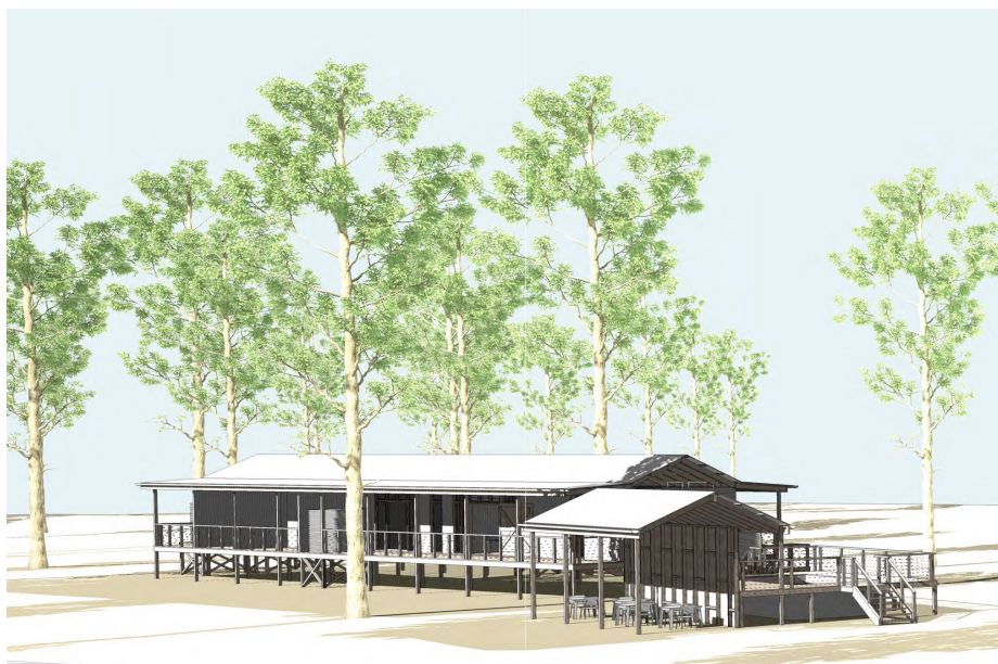
UNWIND: The Thermal Baths will be a place for all to relax in tranquil bushland.

Those wanting to gift or lend their relics to the Dirranbandi Dip should