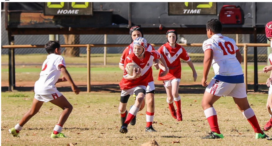
GOLDEN WEEKEND: Junior players from U6 to U14 flocked to Rowden Park for the St George JRL 50th anniversary celebration.

The photographs on this page from Kasey Lockwood show something of the action and colour of the weekend. For more photographs, visit the SGJRL Facebook page.