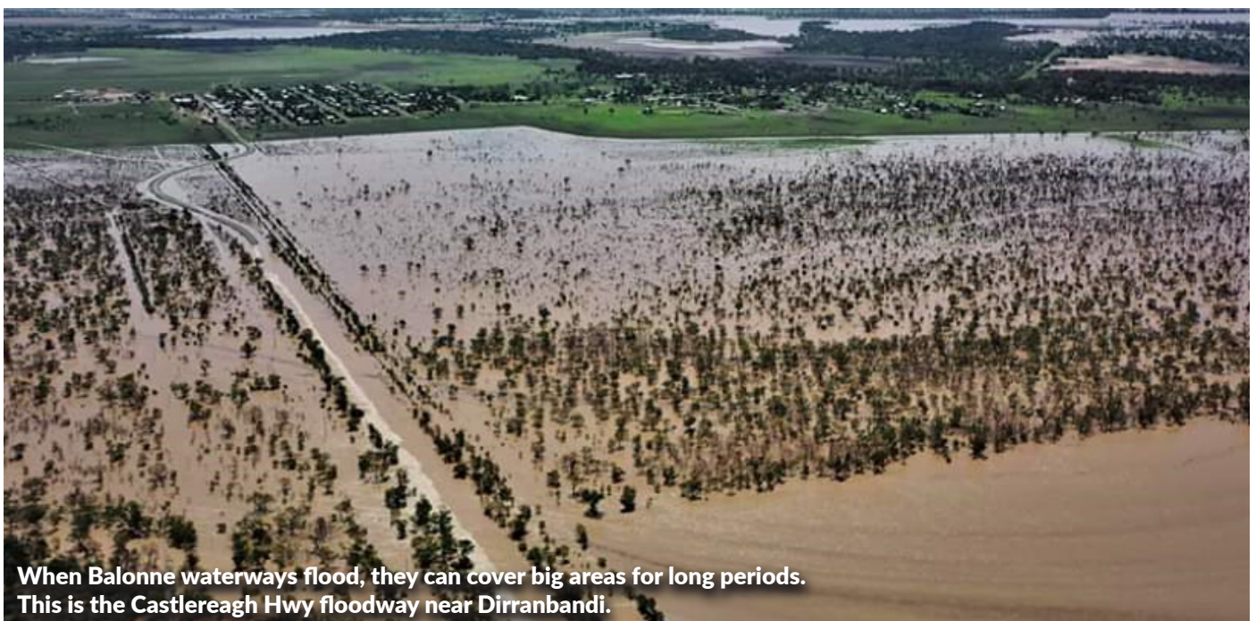
When Balonne waterways flood, they can cover big areas for long periods. This is the Castlereagh Hwy floodway near Dirranbandi.

More information will be available as the project progresses.