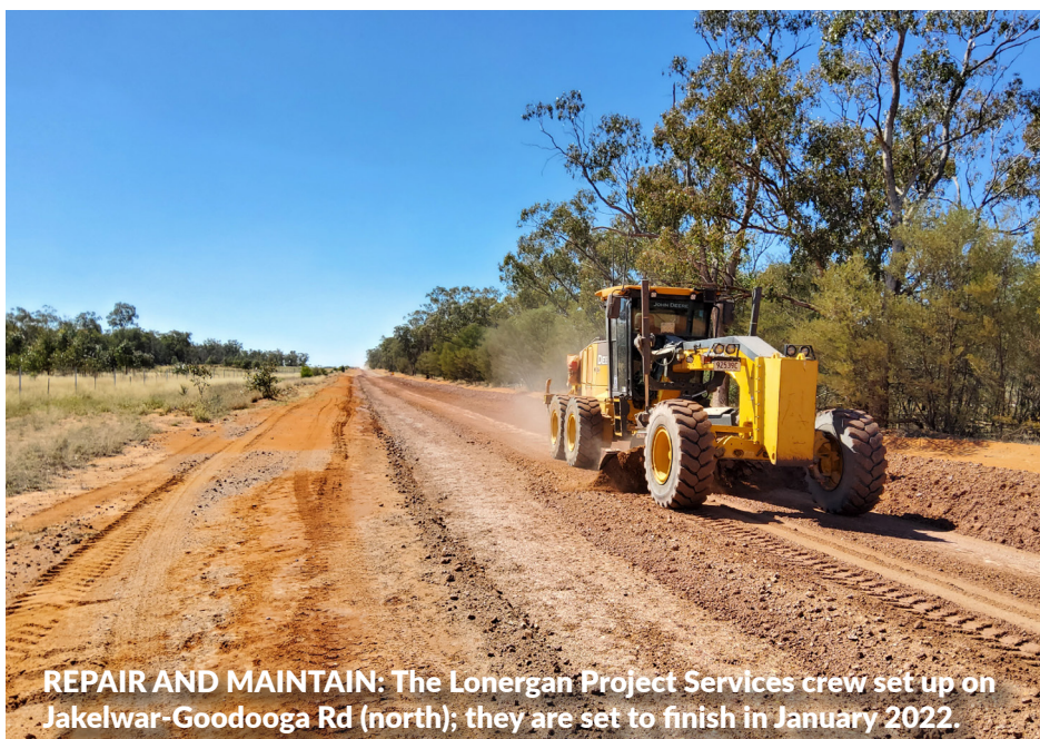
REPAIR AND MAINTAIN: The Lonergan Project Services crew set up on Jakelwar-Goodooga Rd (north); they are set to finish in January 2022.