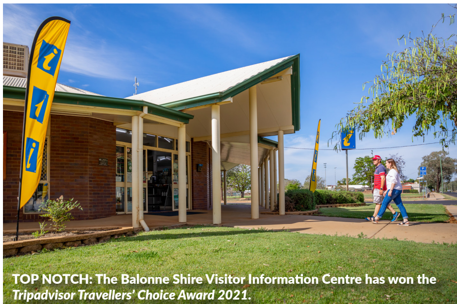
TOP NOTCH: The Balonne Shire Visitor Information Centre has won the Tripadvisor Travellers' Choice Award 2021 .

The testing scheme is run by Queensland Health in partnership with UQ; results add to information obtained through clinical (human) testing, and enhance Queensland Health's COVID-19 response.