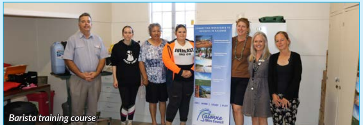
Barista training course