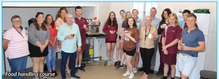
Food handling course

ARE YOU INTERESTED IN BEING A COUNCIL SUPPLIER?