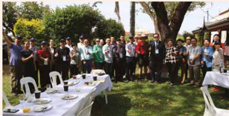
Riversands Wines visit