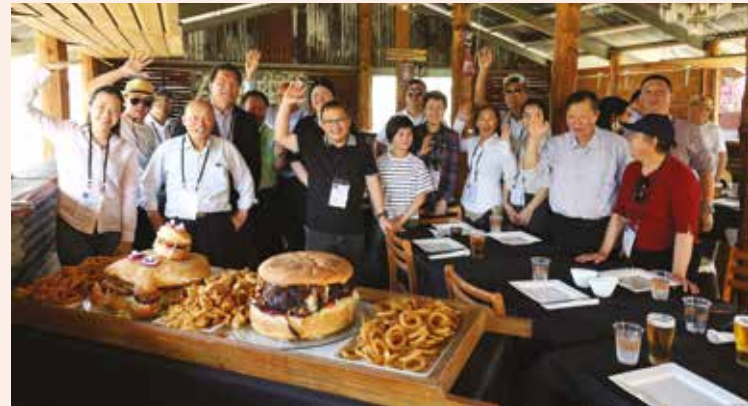
Road Train Burger at Nindigully Pub

"We look forward to building upon the positive outcomes of this visit and remain committed to exploring further opportunities for collaboration, growth, and shared success."