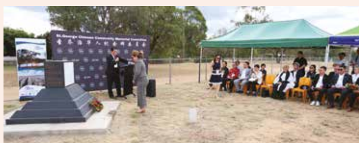
Rededication of The St George Chinese Cemetery