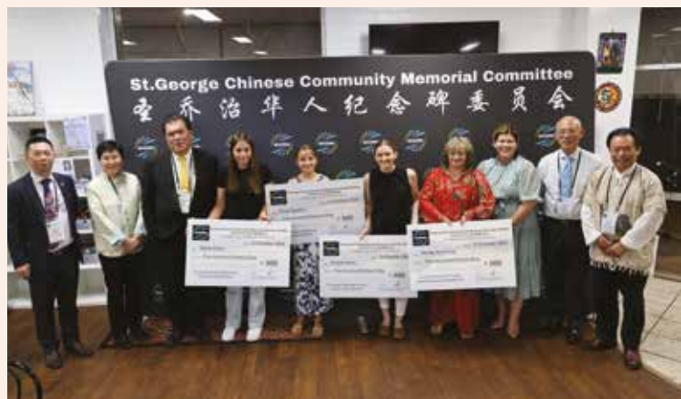
Presentation of SCCMC Bursaries